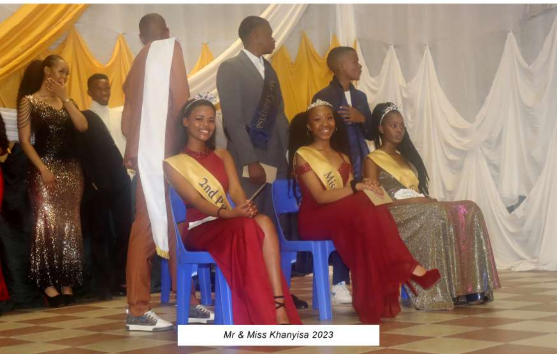
Mr & Miss Khanyisa 2023