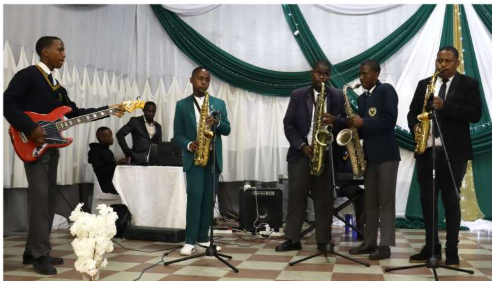
Above: The Khanyisa High School Music Department at the Matric Farewell.