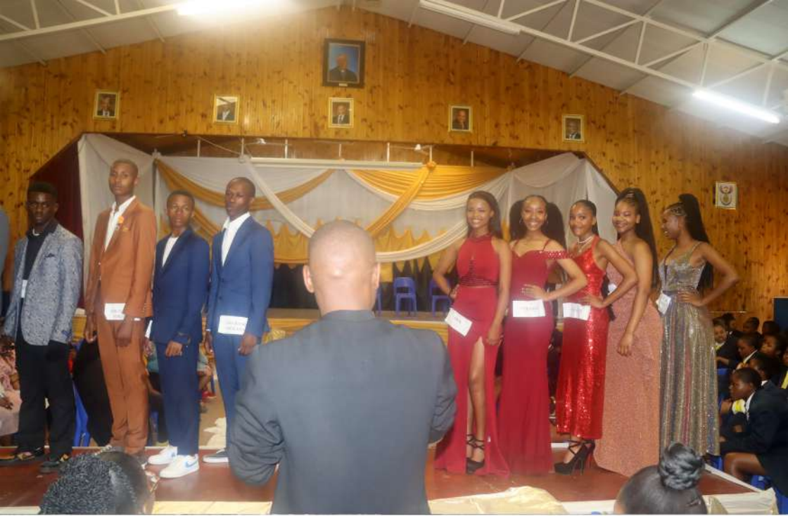
Above: Miss Khanyisa Contestants