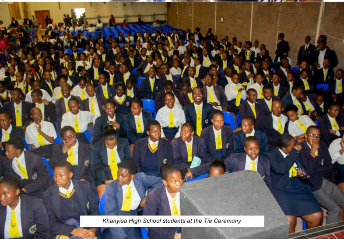
Khanyisa High School students at the Tie Ceremony