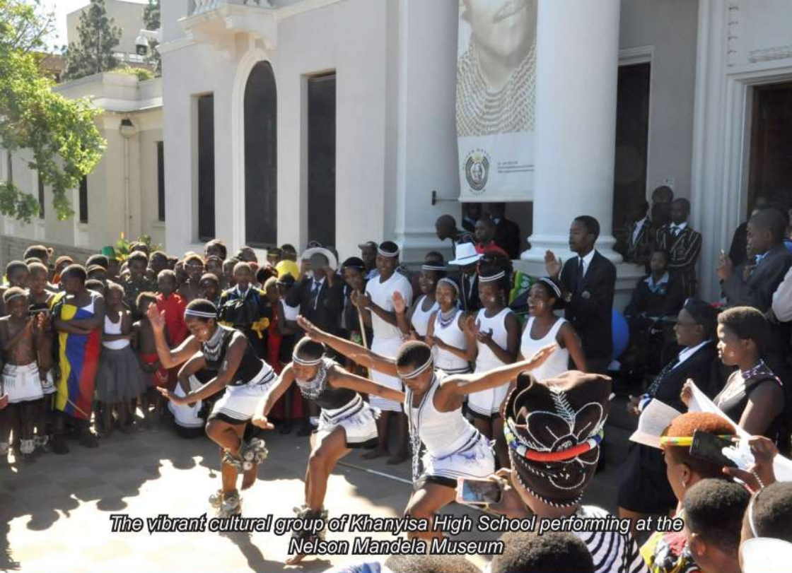
The vibrant cultural group of Khanyisa High School performing at the Nelson Mandela Museum