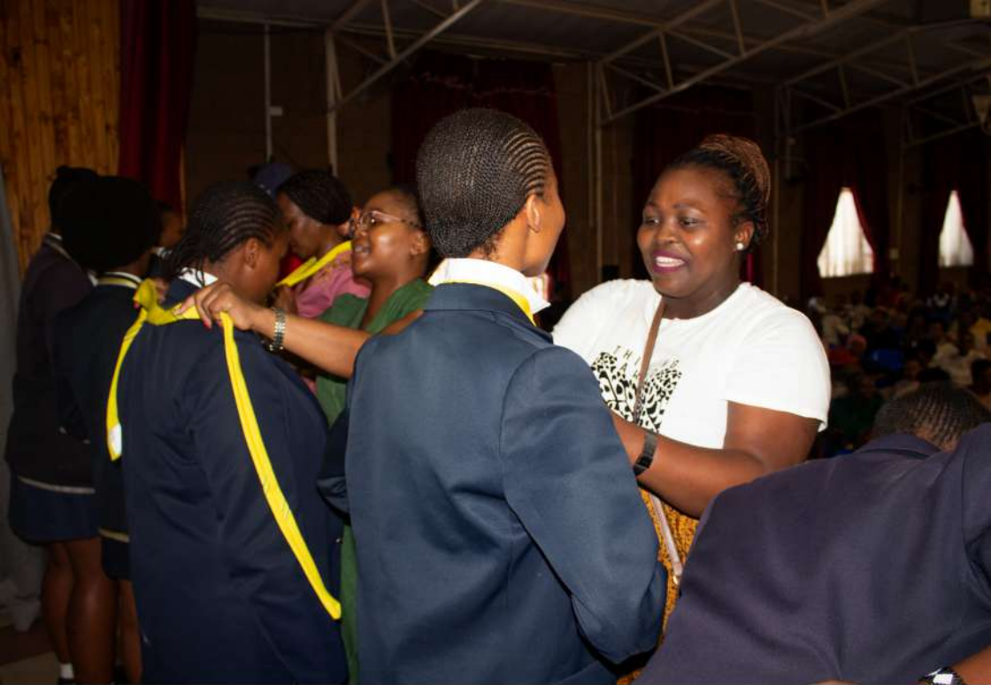
Joy & happiness at the Tie Ceremony